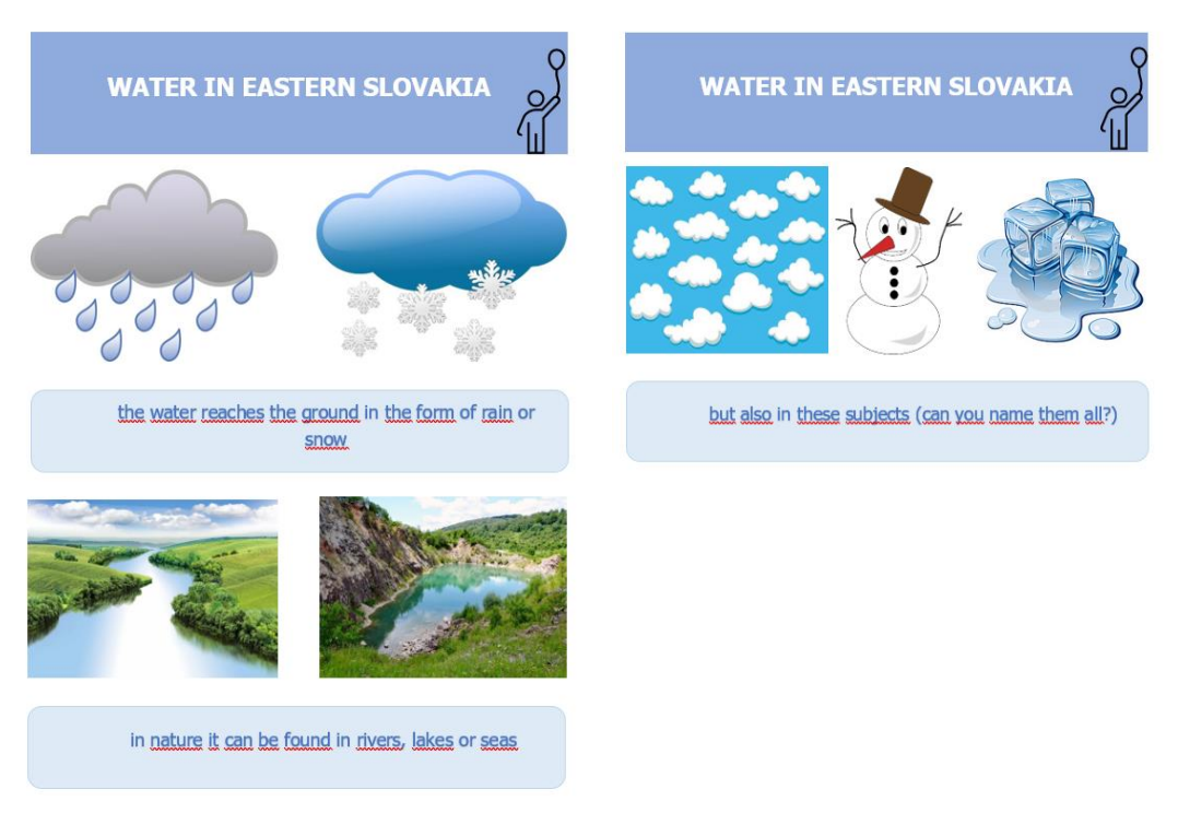
Figure 2. Pictures of the water for kindergarten children (originally in Slovak language)

The following topic Household water also contains some easy pictures for kindergarten children. In this section, the pictures are aimed to how can kids save the water in their own household. For example, using shower instead of the bath, stop the water while brushing teeth and using the rainwater to water the flowers.