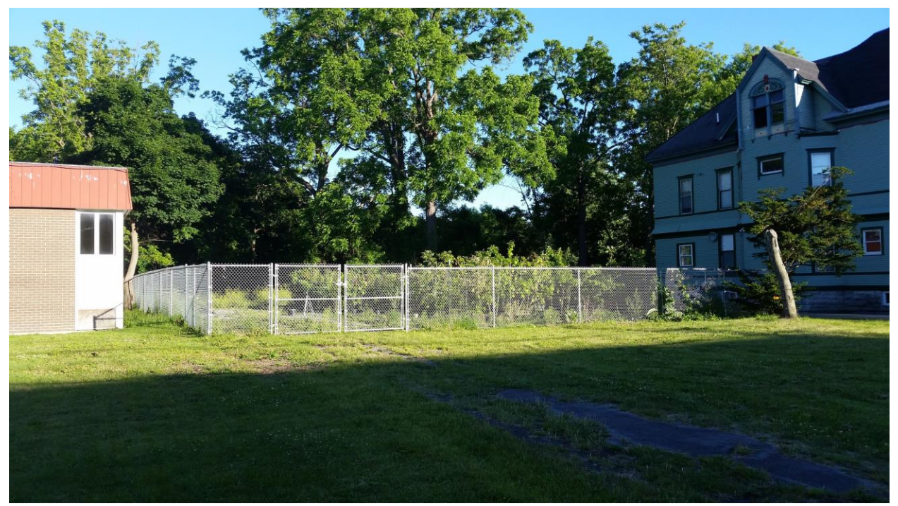
Figure 2. ASLF urban tree nursery in Syracuse, NY, USA