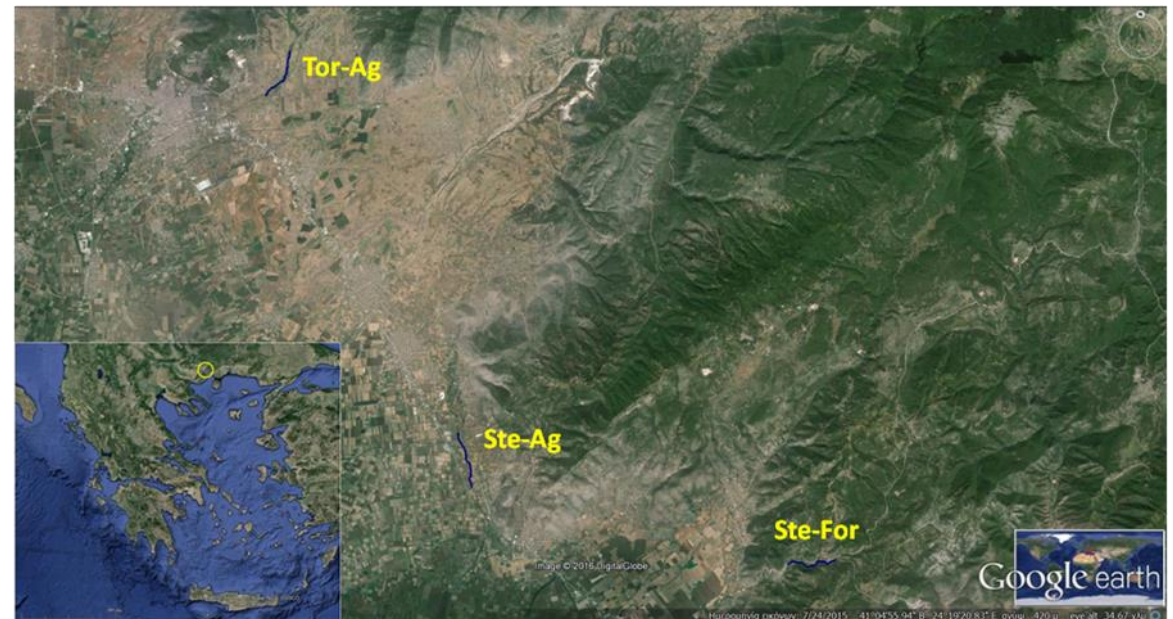
Figure 1. The location of the study areas in Greece (Bottom left corner). The surveyed riparian areas (in blue) of the study areas that were: a) Tor-Ag - natural woody vegetation along a torrent with intermittent flow adjacent to agricultural fields b) Ste-Ag - natural woody vegetation along a stream with perennial flow adjacent to agricultural fields, and c) Ste-For - natural woody vegetation along a stream with perennial flow adjacent to forested areas

ecotype again was the Forest Eastern Sycamore ( Platanion orientalis ) (NATURA 2000 code: 92C0) (Zogaris et al. 2007). The dominant species were the eastern Sycamore tree ( Platanus orientalis ) and Rubus sp. The land-uses beyond the riparian vegetation were agricultural crops, pastures and grasslands. The final study area was along Lydia stream that had perennial flow. The reach was approximately 2 km with the elevation ranging from 58 to 62 m. The riparian ecotype differed and was the Forest Galleries with Willows ( Salix alba ) and Poplars ( Populus alba ) (NATURA 2000 code: 92A0) (Zogaris et al. 2007). The species that dominated were black poplar ( Populus nigra ), willow ( Salix alba ), white poplar ( Populus alba ), Rubus sp. This is also another characteristic riparian habitat of the Euro-Mediterranean region. The land-uses beyond the riparian area was mostly agricultural crops, such as corn, wheat, sunflower, alfalfa and a large variety of vegetables.