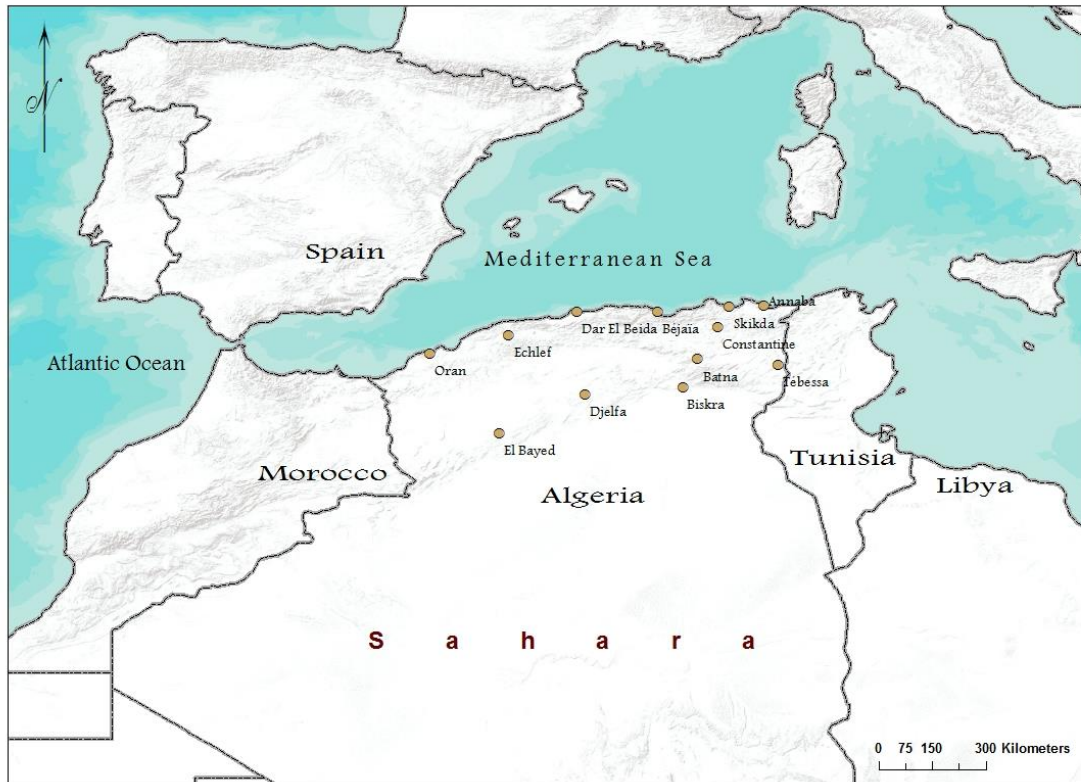
Figure 1. Map of study area localization

The objective of this paper is to analyze the rainfall and temperature trend for over forty years of measurements over a wide band of northern Algeria. Twelve stations that provide a common measurement period were selected for this study (table 1 and figure 1). The data have been obtained from the national meteorological networks national meteorology office (ONM, 2013, http://www.meteo.dz/ ) for Algeria, and have been supplemented by information collected on the “NOAA, National Climatic Data Center, 2013) ” website” ( http://www.ncdc.noaa.gov , http://www.ncdc.noaa.gov ).