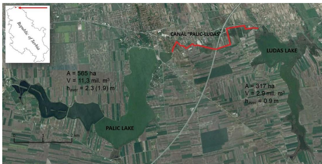
Figure 1. Surroundings of Palic and Ludas Lake (A – area; V – volume; h – average depth)

The data analysed in this paper was collected from two very shallow Pannonian lakes, Palic and Ludas, located at the periphery of the Suboticko-Horgoska Pescara (sand area), at the north of the Republic of Serbia (Figure 1). The lakes are shallow Pannonian lakes, created a million years ago, when the wind created pits separated by dunes that were recharged mostly by natural precipitation and several small water streams.