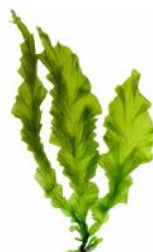
Figure 4. Enteromorpha intestinalis