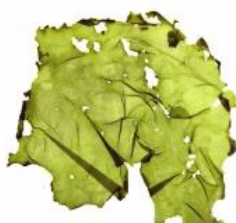
Figure 3 Ulva rigida