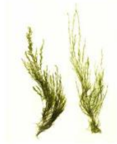
Figure 5. Cladophora vagabunda