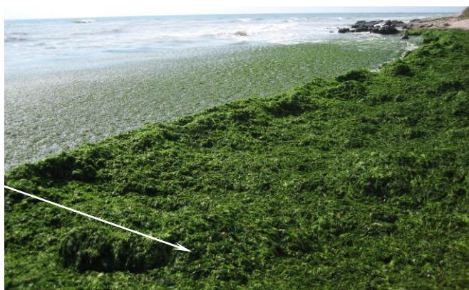
Figure 2. Macro-algae deposit from the shore area of the southern Romanian littoral of the Black Sea.

Observations and studies that we have done over several years (2009 - 2012) enabled us to identify the two summer periods in which large amounts of macro-algae are detached from the substrate and bonded to the shore (especially in the group of green algae - Chlorophyta): in June – August (Fig. 2, Fig. 3, Fig. 4, Fig 5).