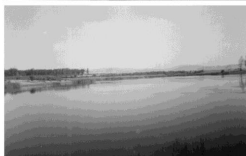
Photo. 3 Canal stemming from Văcărești storage lake Photo. 4. Udrești storage lake

Also included in the lacustrine landscape of the Plain of Târgoviște are the basins serving as fish ponds for research belonging to the Station of Fisheries Research, Nucet, one of the best developed pilot fisheries of Eastern Europe.