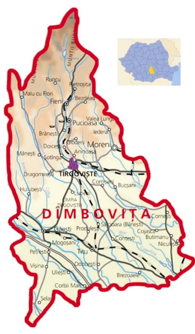
Figure 1. Geographic location of the Plain in Dâmboviţa County

interfluves is gradual. It contains the following subunits: