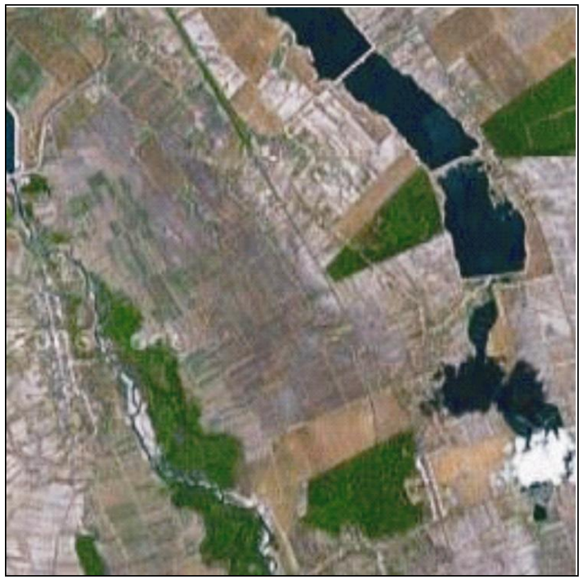
Figure 3. Satellite image of the storages along Ilfov River and Nucet Station

Two of these lakes have started an agro-tourist program in the year 2007, the arrangements being created using SAPARD funds.