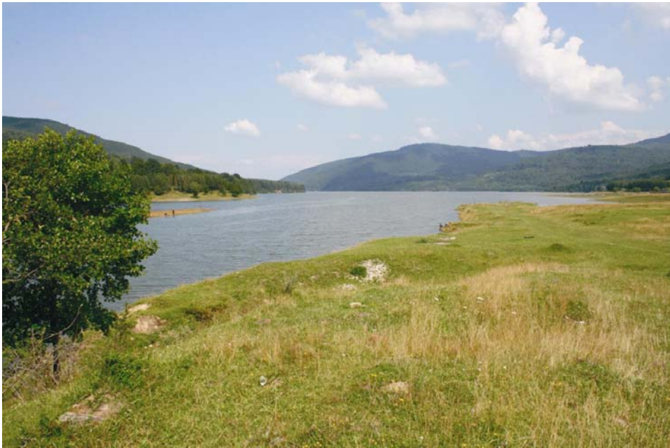
Figure 2. Poiana Uzului Lake Storage