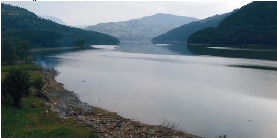
Figure 5. Izvorul Muntelui Lake tail in the area of the viaduct