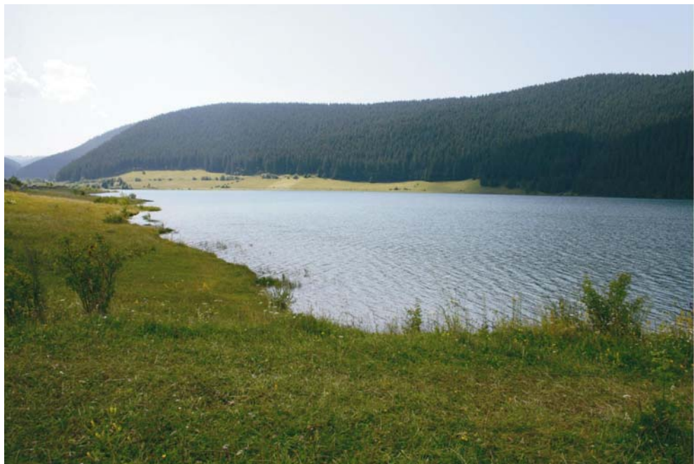
Figure 3. Frumoasa Lake storage, meant to supply water for Miercurea Ciuc town