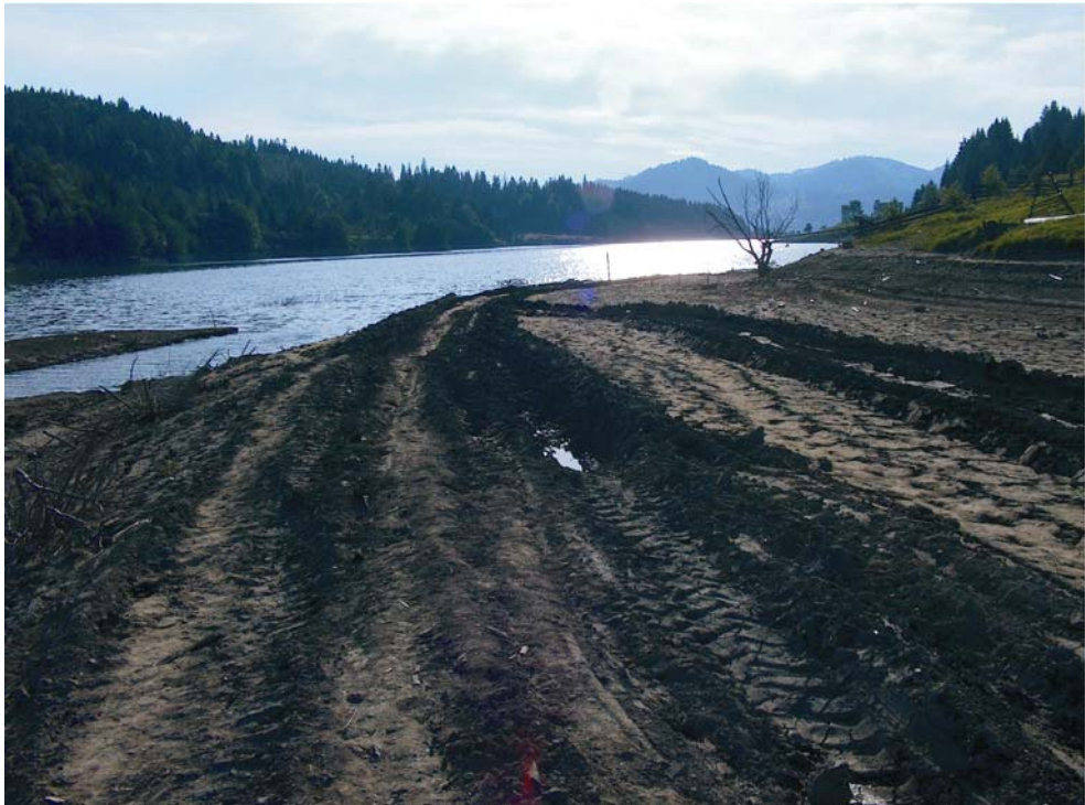
Figure 10. Colibița Lake, supplying water for Bistrița Town