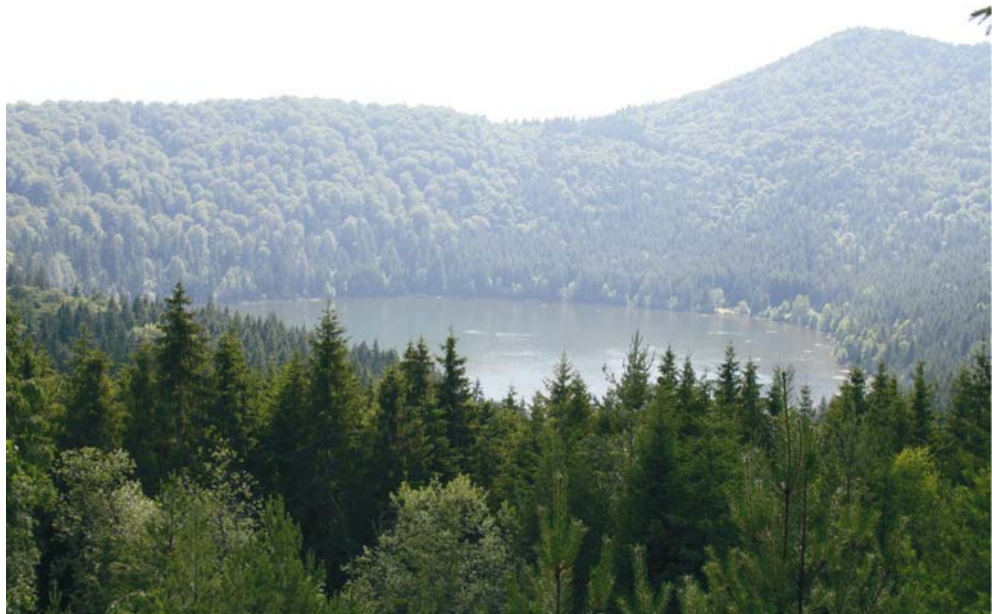
Figure 4. Sfânta Ana volcanic lake of the Ciomatu Mare Massif