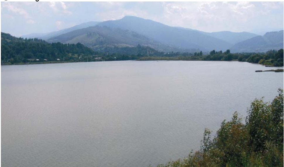
Figure 7. Stejaru (Bâtca Doamnei) Lake on Bistrița River