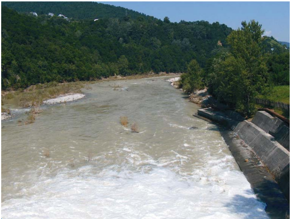
Figure 8. Vaduri Lake on Bistrița River