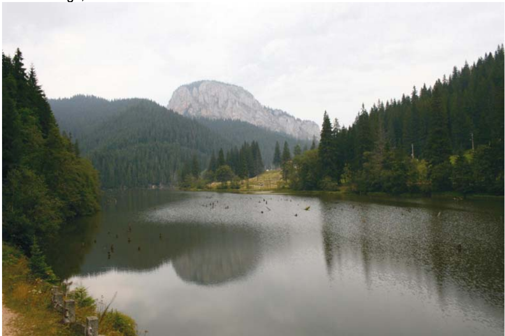
Figure 11. Roșu Lake and Suhard Mountain