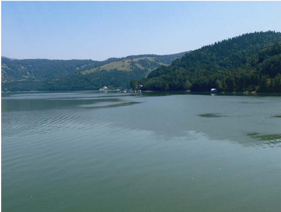
Figure 6. Izvorul Muntelui Lake near the dam