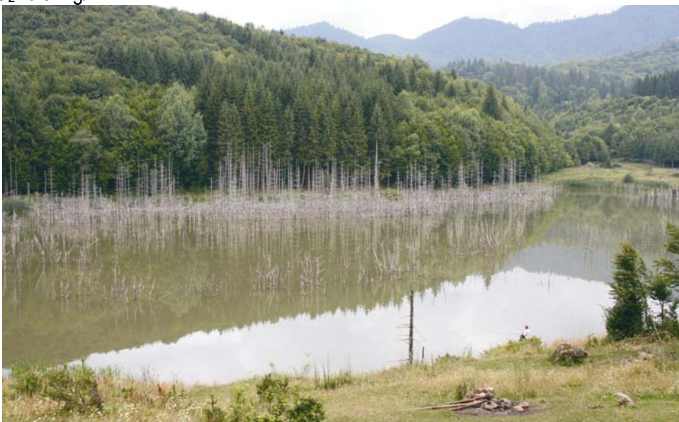
Figure 9. Crucii Lake formed following a landslide